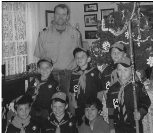
The Tigers at the museum