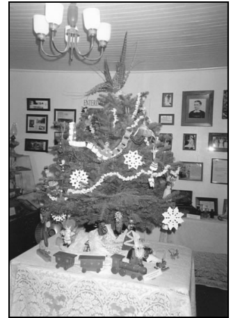
The Nichols House shows off its pioneer Christmas finery for the annual Christmas in Alpine home tour presented by The Alpine Woman's Club

Our volunteers are dedicated, warm and friendly and welcome others to join them. It's never boring and always rewarding. Join us today! ■